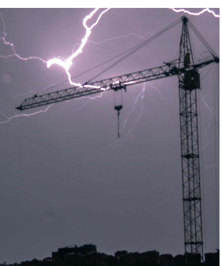
Note: TSM is not a lighting protection device. However if there is lighting in nearby area, the TSM will absorb electrical disturbances

All SCANCON incremental encoders for wind turbine applications have built-in TSM protection.