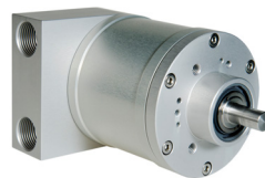
EXME - Shaft