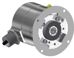
REXM-H – Hollow Shaft